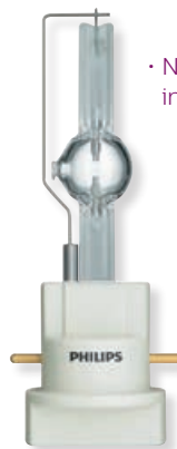
MSR Gold™ MiniFastFit