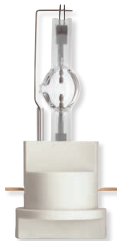
MSR Gold™ FastFit