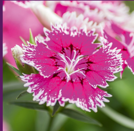
Esmeralda Farms (Cut flowers)

“After four months working with the LED flowering lamps, an outstanding 91% reduction in energy costs, amounting to a total of US$ 18,000, was achieved. This is equivalent to an energy saving of US$ 16.50/hour/hectare. It is estimated that the investment will be recouped within the space of 11 months. The long lifetime and improved water resistance of the LED flowering lamps resulted in reduced labor costs, because now there is no need for the lamps to be replaced every day.”