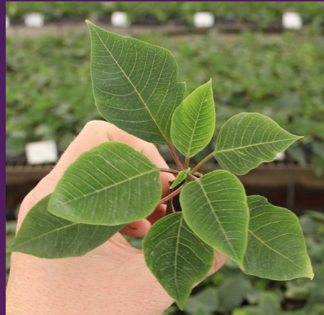
Florensis Kenya Ltd. (Bedding plants)

Given that light is an important production resource for growers and also represents an important factor in plant research, Philips has been carrying out various practical tests in conjunction with horticultural companies and research experts. These tests provide valuable information that can be used in product design. They also highlight the versatility of LED solutions and the cost-effective opportunities they offer for ensuring optimum yield and plant quality.