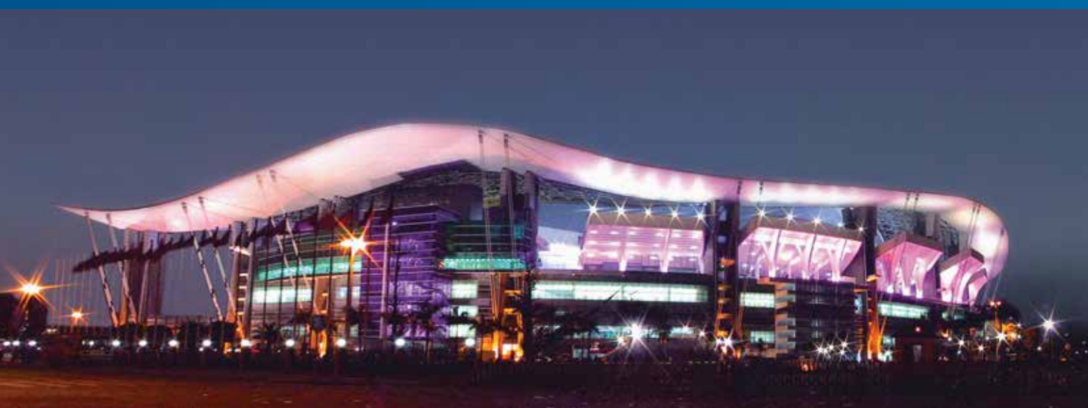
Guangzhou Stadium, China

Discover how Philips can design and install a state-of-the-art, energy efficient and simple to manage lighting control system at your stadium, arena or auditorium.