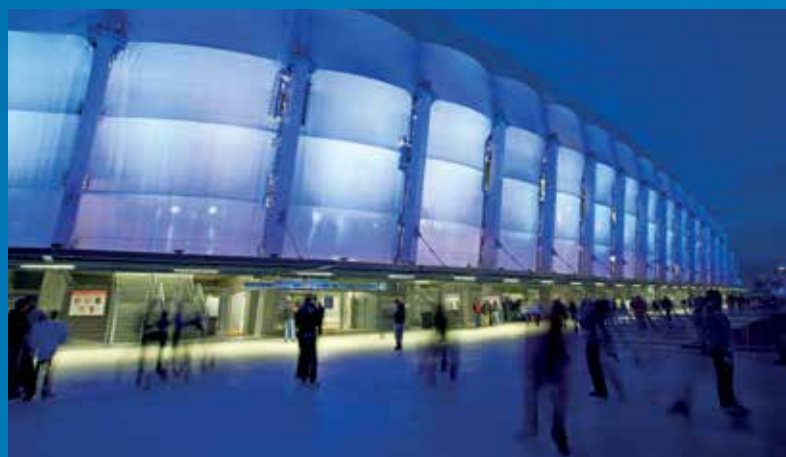
Poznan City Stadium, Poland