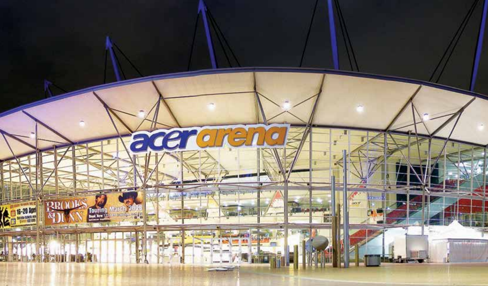
Acer Arena, Sydney, Australia