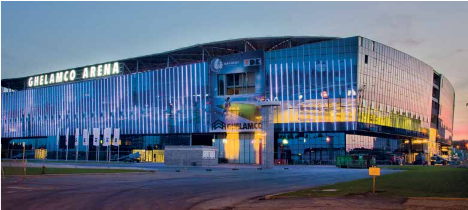
Ghelamco Arena, Ghent, Belgium

Philips provided not just products but also services for the project, taking responsibility for supply and installation of the complete lighting system including retail stores and other facilities, with a 10 year maintenance contract underlining the outstanding level of cooperation.