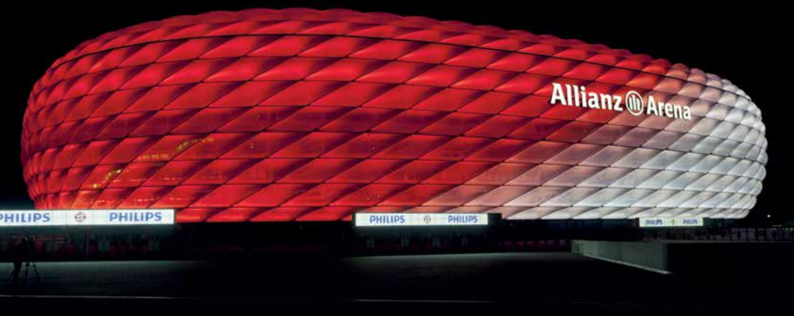
Allianz Arena, Germany

“ Venues save on operating costs, gain safety and generate new revenue by becoming truly multipurpose ...”