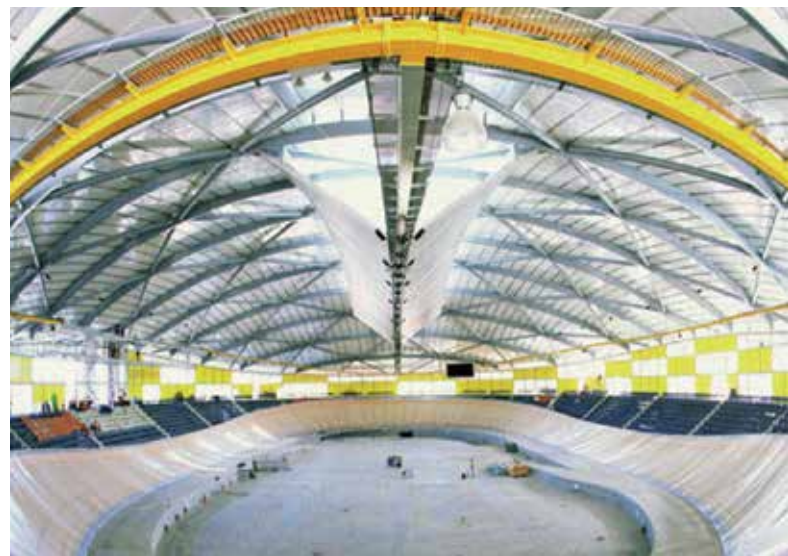
Dunc Grey Velodrome

Using the Philips Dynalite lighting control configuration software DLIGHT, the system was monitored remotely by Philips engineers to ensure there were no interruptions to lighting and no technical hitches.