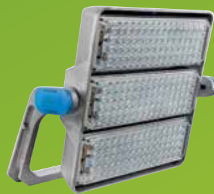
ArenaVision LED system