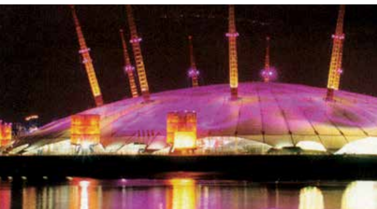
The theatrical and entertainment lighting of the dome is controlled by the DynaLite control system.

“With a reputation as a provider of innovative and reliable lighting solutions for outdoor public spaces, Philips was chosen to install an innovative lighting system to meet the demands of and extensive network of theatrical and entertainment lighting.”