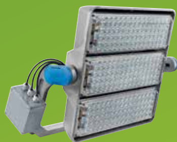
ArenaVision LED with connection box