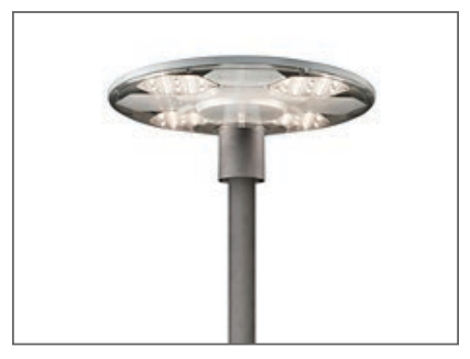
TownGuide More about the product >