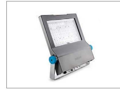
Clearflood More about the product >

© 2017 Philips Lighting Holding B.V. All rights reserved. Philips reserves the right to make changes in specifications and/or to discontinue any product at any time without notice or obligation and will not be liable for any consequences resulting from the use of this publication.