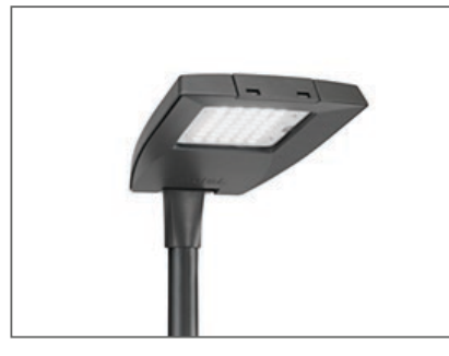
Luma More about the product >