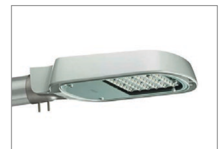
ClearWay More about the product >