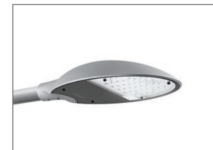
MileWide gen2 More about the product >