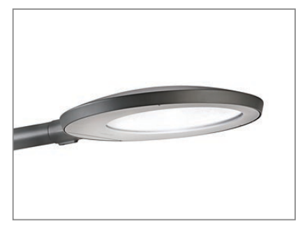
CitySoul gen2 More about the product >