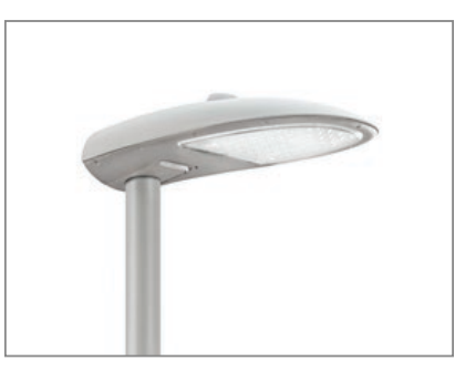
Iridium gen3 More about the product >