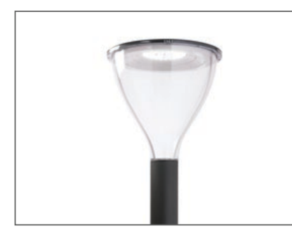
Metronomis LED More about the product >