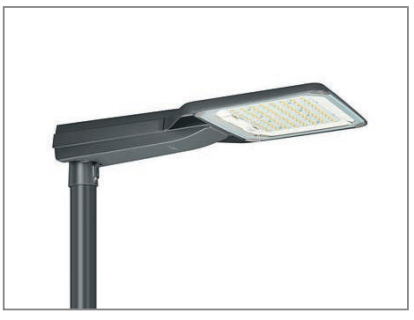
DigiStreet More about the product >