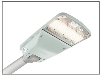
UniStreet More about the product >