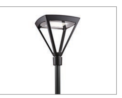
ClassicStreet More about the product >