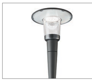
CityCharm More about the product >