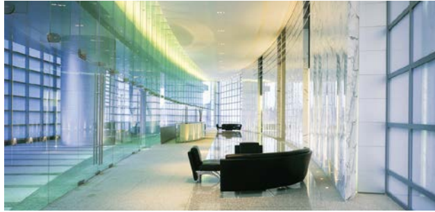
Reception and indoor public area