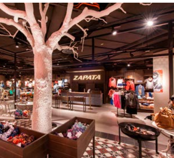
Zapata, Augsburg Germany