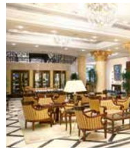
2 Reception and lobbies