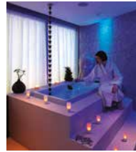
6 Wellness areas