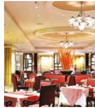
5 Bars, restaurants and lounges