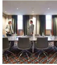
7 Conference and meeting areas