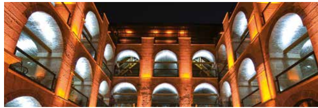
2 Reception and lobbies