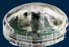
EasyAir outdoor module