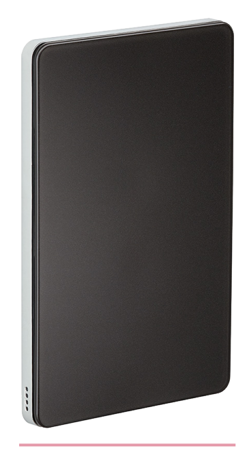
PA2BPA - Two buttons