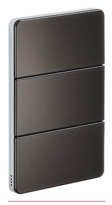
PA6BPA - Six buttons