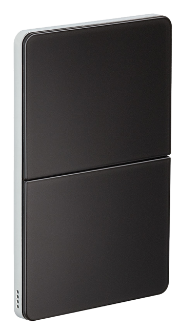
PA4BPA - Four buttons