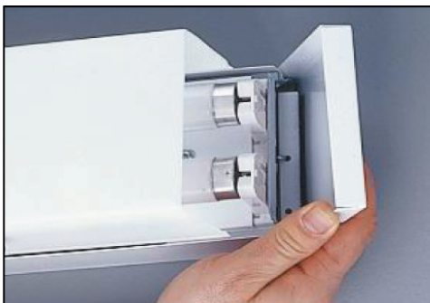
Spring-loaded end cap.