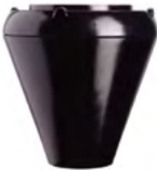
M Smooth Tapered Cone