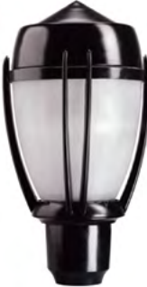
L 8 Legs