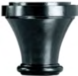
R Smooth Tapered