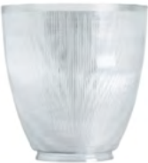
Narrow Body CL32/CL52