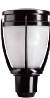
K 4 Legs