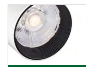
Recessed lens providing visual comfort