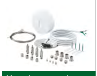
Mounting accessoires available