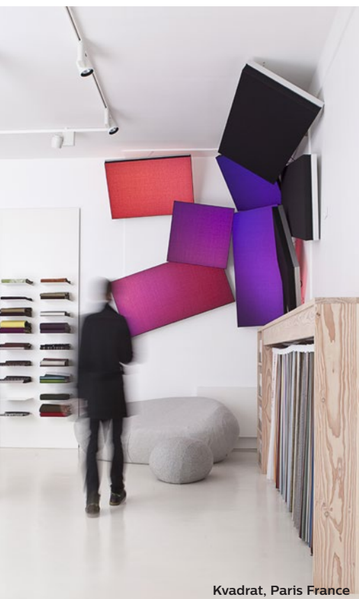
Kvadrat, Paris France