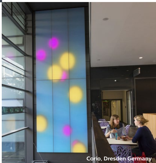
Corio, Dresden Germany

Modern offices can feel cold and impersonal. Luminous textile is the perfect way to emphasize your company's personality. It adds the warmth and inspiration that stimulates creativity, improves productivity and energizes office life. With softened sound to improve concentration and promote well being. So business is a pleasure.