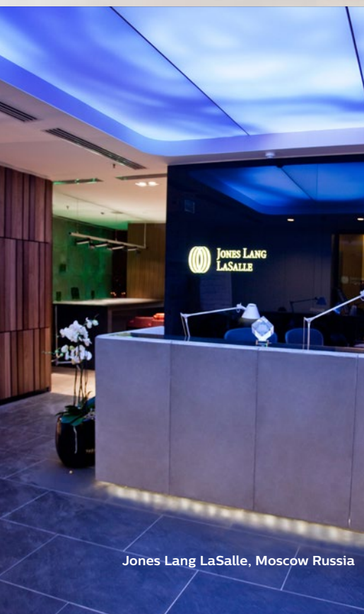
Jones Lang LaSalle, Moscow Russia