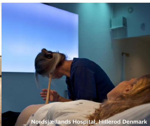
Nordsjællands Hospital, Hillerød Denmark