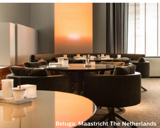
Beluga, Maastricht The Netherlands

Every space demands its own meaningful solution. Luminous textile helps you achieve your boldest visions and capture the essence of a space in a totally unique way.