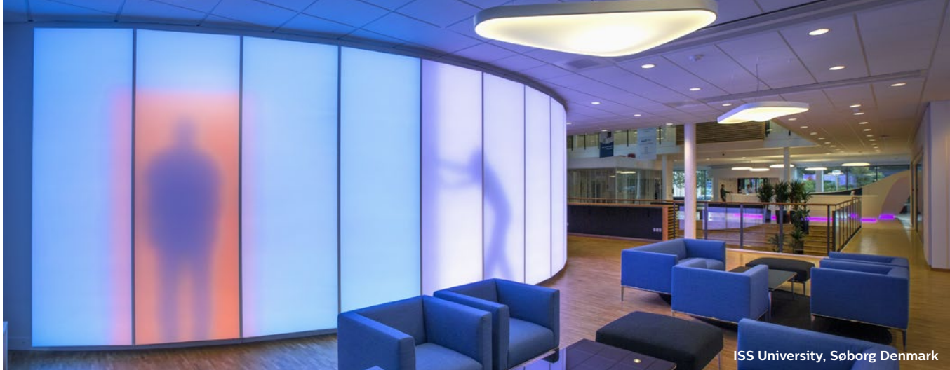
ISS University, Søborg Denmark