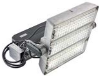
OptiVision LED gen2

A new era in smart area and sports lighting