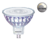
Master LEDspot Dimtone 7-50W MR16 9290020589