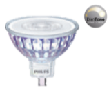
Master LEDspot DimTone 5-35W MR16 9290019047