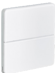
White Black labeling