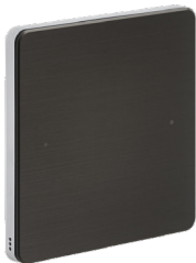
Jet Off-white labeling