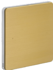
Gold Black labeling