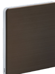
Vintage Off-white labeling