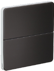
Magnesium White labeling