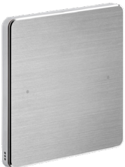
Aluminum Black labeling

NOTE: Flare colors are created through a batch-controlled anodizing process. Separate batches may vary slightly in color and surface appearance.