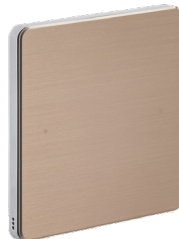
Prestige Black labeling