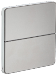
Silver Black labeling