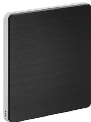
Noir Off-white labeling