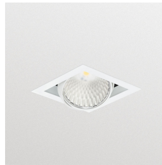
GreenSpace Accent Gridlight GD301B luminaire