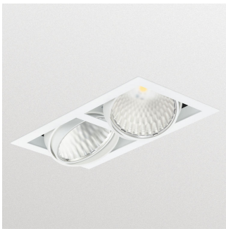
GreenSpace Accent Gridlight GD302B luminaire