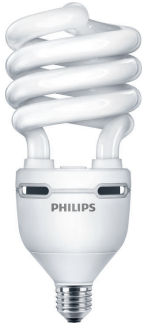
45.0 W;E27 ;Spiral