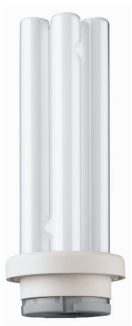
14W, GR14q-1, 4P