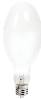
EX39, ED-37, Coated