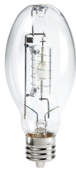
EX39, ED-28, Clear