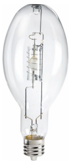
EX39, ED-37, Clear