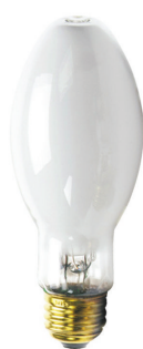
BD17 Medium Coated