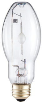
BD17, Med, CL, Elite