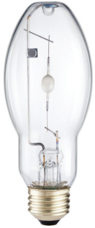
ED17 Clear Medium Elite