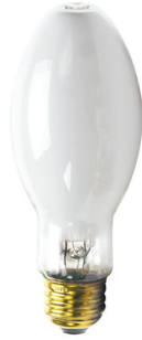
BD17 Medium Coated