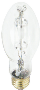
E26, ED-17P, CL, Alto & Fadeblock