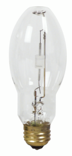
E26, ED-17, Clear