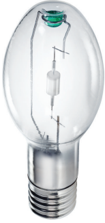
100W, E39/EX39, ED-23 1/2, Clear