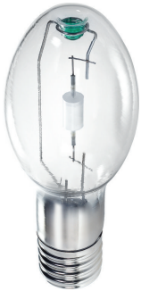
150W, E39/EX39, ED-23 1/2, Clear