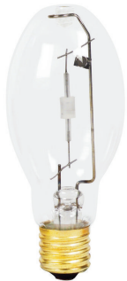
E39, ED-28, Clear