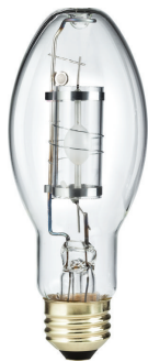
E26, ED-17P, CL, Elite, 70-100W /940