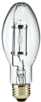
E26, ED-17P, CL, Elite, 50W /940