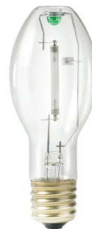
E39, ED-23 1/2, Clear