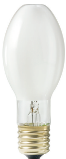
E39, ED-23 1/2, Coated