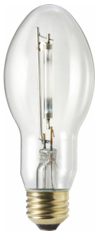
100 W Single Contact Medium Screw BD-17 Clear