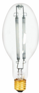
1000 W Single Contact Mogul Screw ED-37 Clear