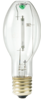
E39, ED-23 1/2, Clear