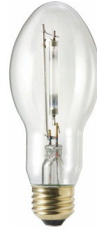
E26, BD-17, Clear