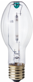
70 W Single Contact Mogul Screw ED-23 1/2 Clear