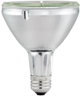
PAR30L Med. Base