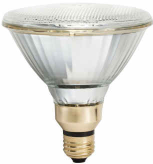
CDM PAR38 Medium Base