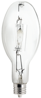
EX39, ED-37, Clear