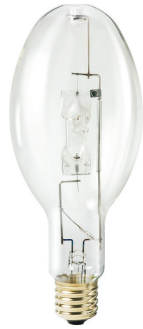
E39, ED-37, Clear