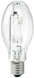
E39, ED-28, Clear