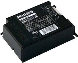
HID-CV 35, 50, 70 /S CDM