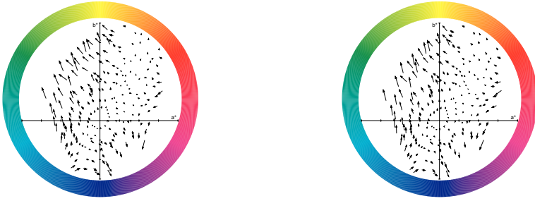
LDCR_CDMTC-E_0002-Colour rendering diagram