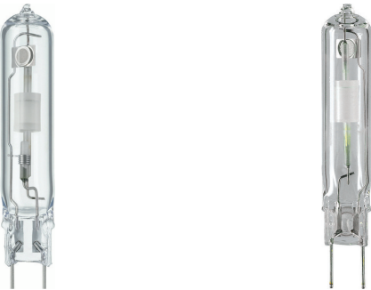
LPPR CDM-TC 0001