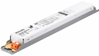
EXC 35 SOX 220-240V 50/60Hz