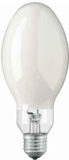
LPPR HPL E26 E27