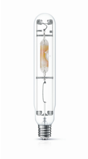
HPI-T 1000W E40