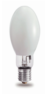
E40 & E39 Coated