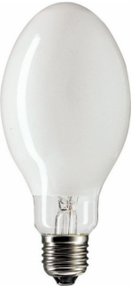
LPPR ML E27