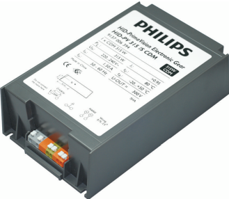
GPPR IPVCDMXt PHL 0003