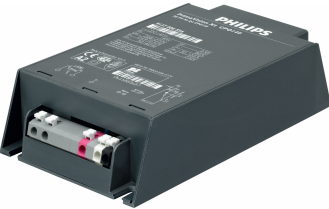
GPPR IPVCP0Xt PHL 0012