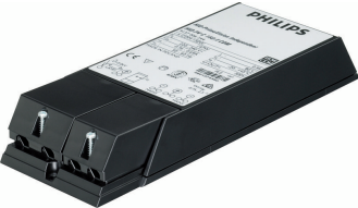
HID-PV C 150 /I