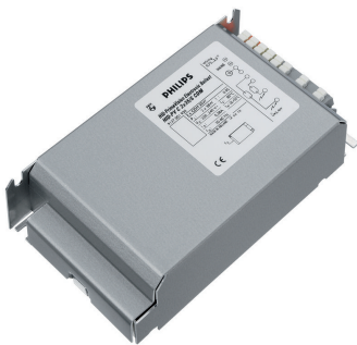
HID-PV C 2x35 /S