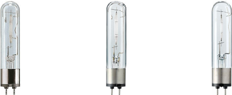
LPPR SDW-T 100W PG12-1