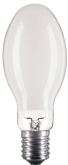
MASTER SON PIA Plus E40